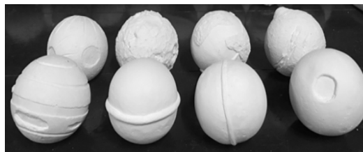
Figure 2: The learning media about the solar system.