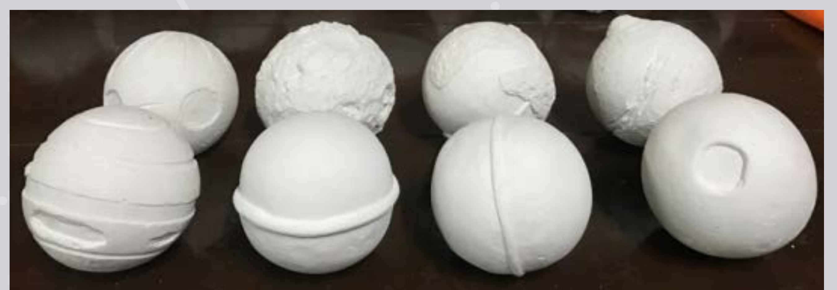
Figure 1: The learning media about the solar system.

Therefore, This model is the solar system learning media for blind people, which can be used actually.