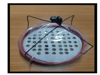
Fig 3 Show a planting tray covered with clear plastic. to control environmental factors.